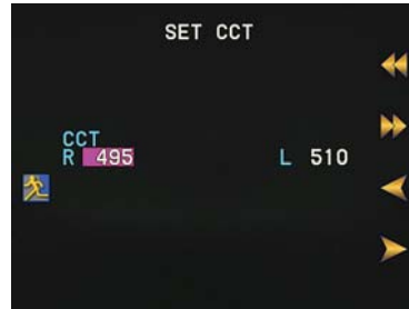
Entered patient's corneal thickness