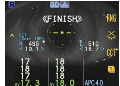
Compensated patient's IOP